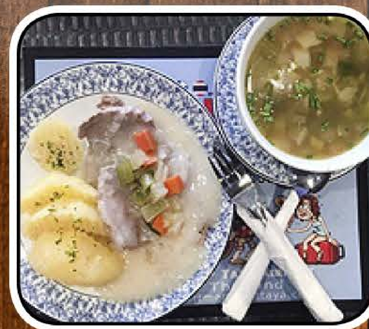
FERSKT KJØTT & SUPPE - 325 B