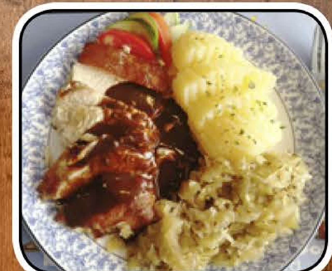
SVINESTEK M/SURKÅL - 295 B