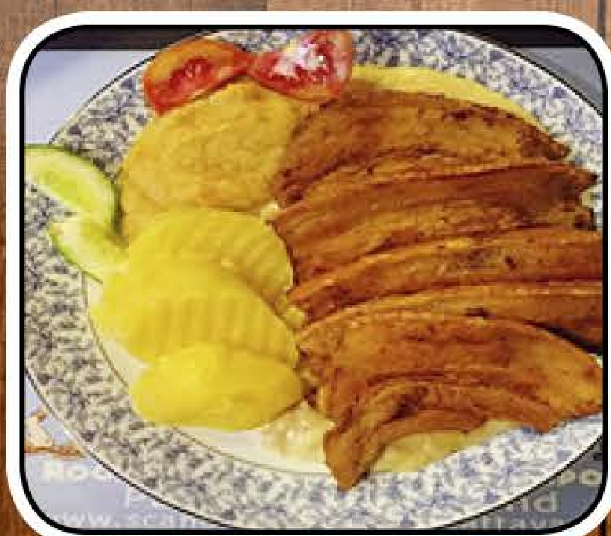
STEKT FLESK 295 B