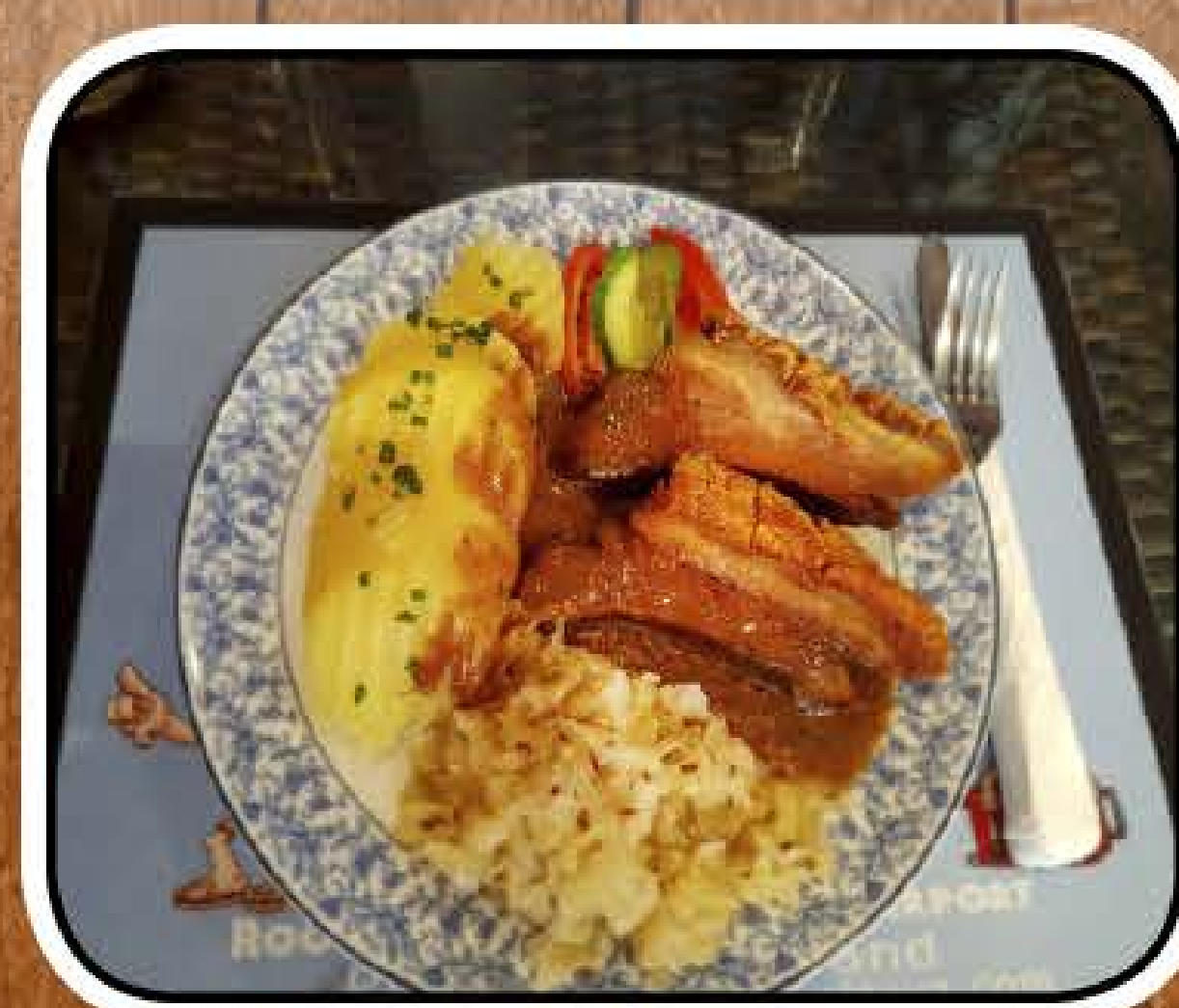
RIBBE M/TILBEHØR 295 B