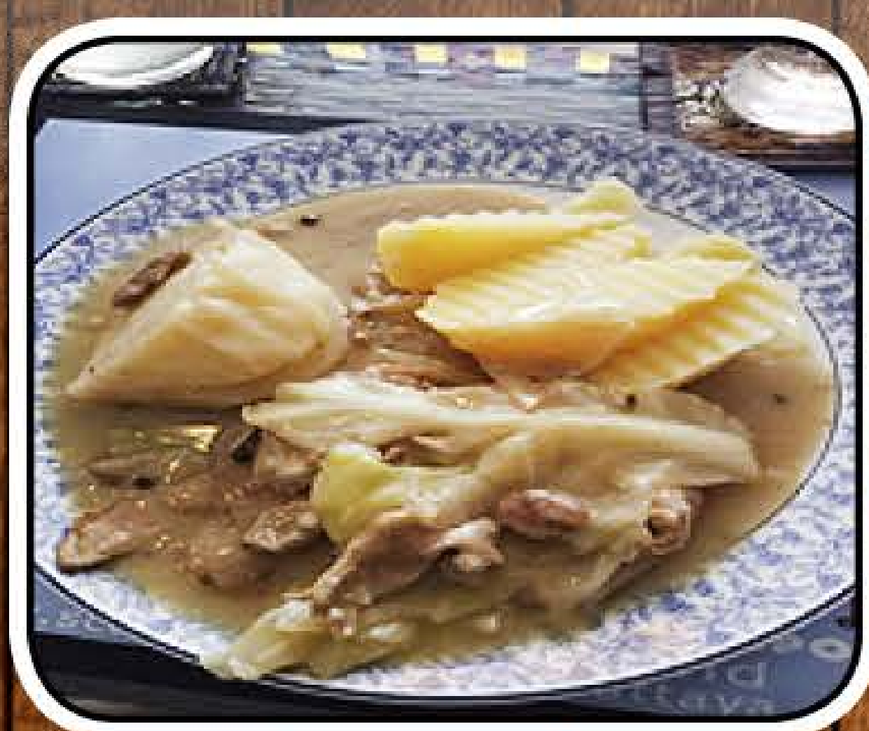
FÅRIKÅL 325 B