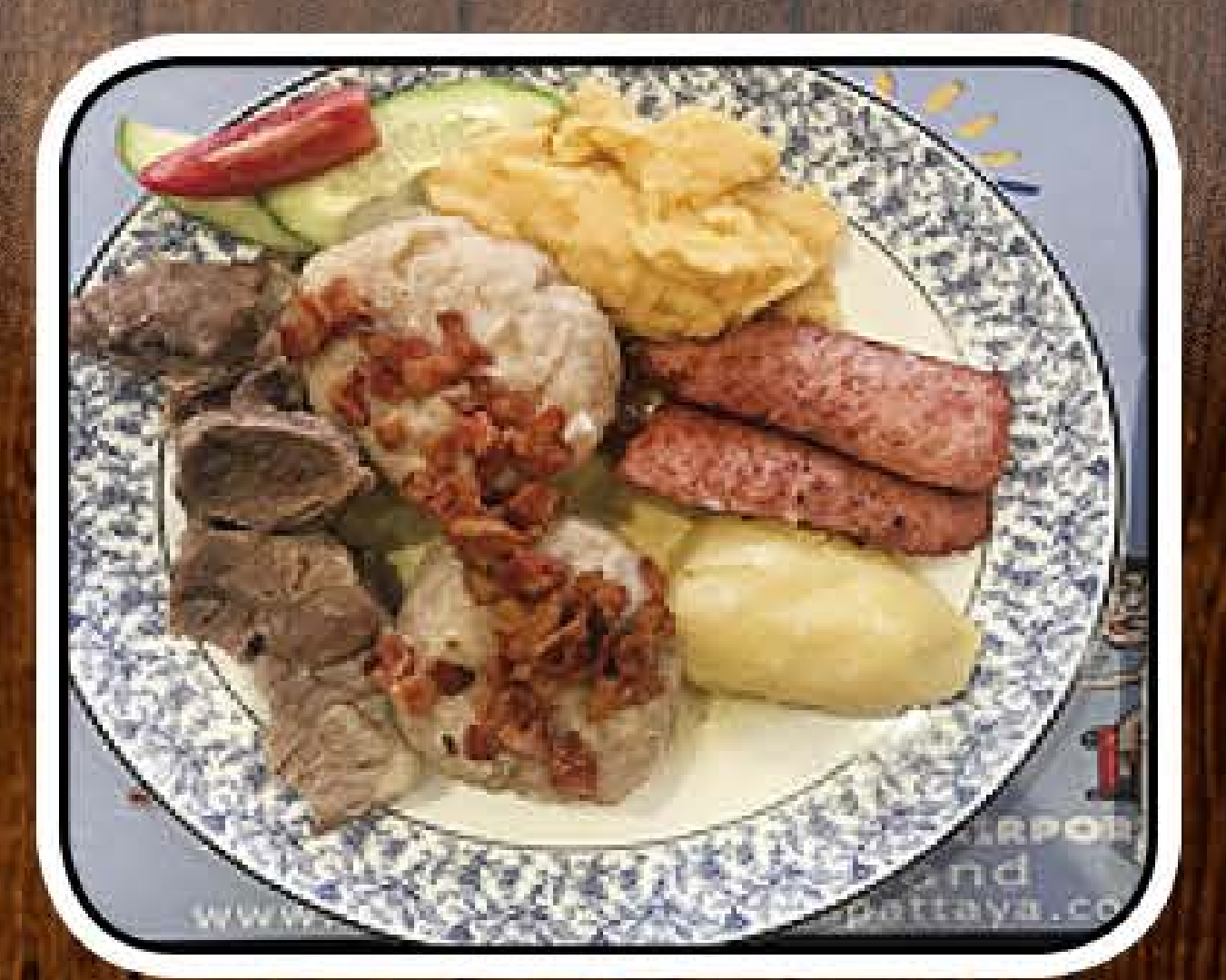
KOMLE 325 B