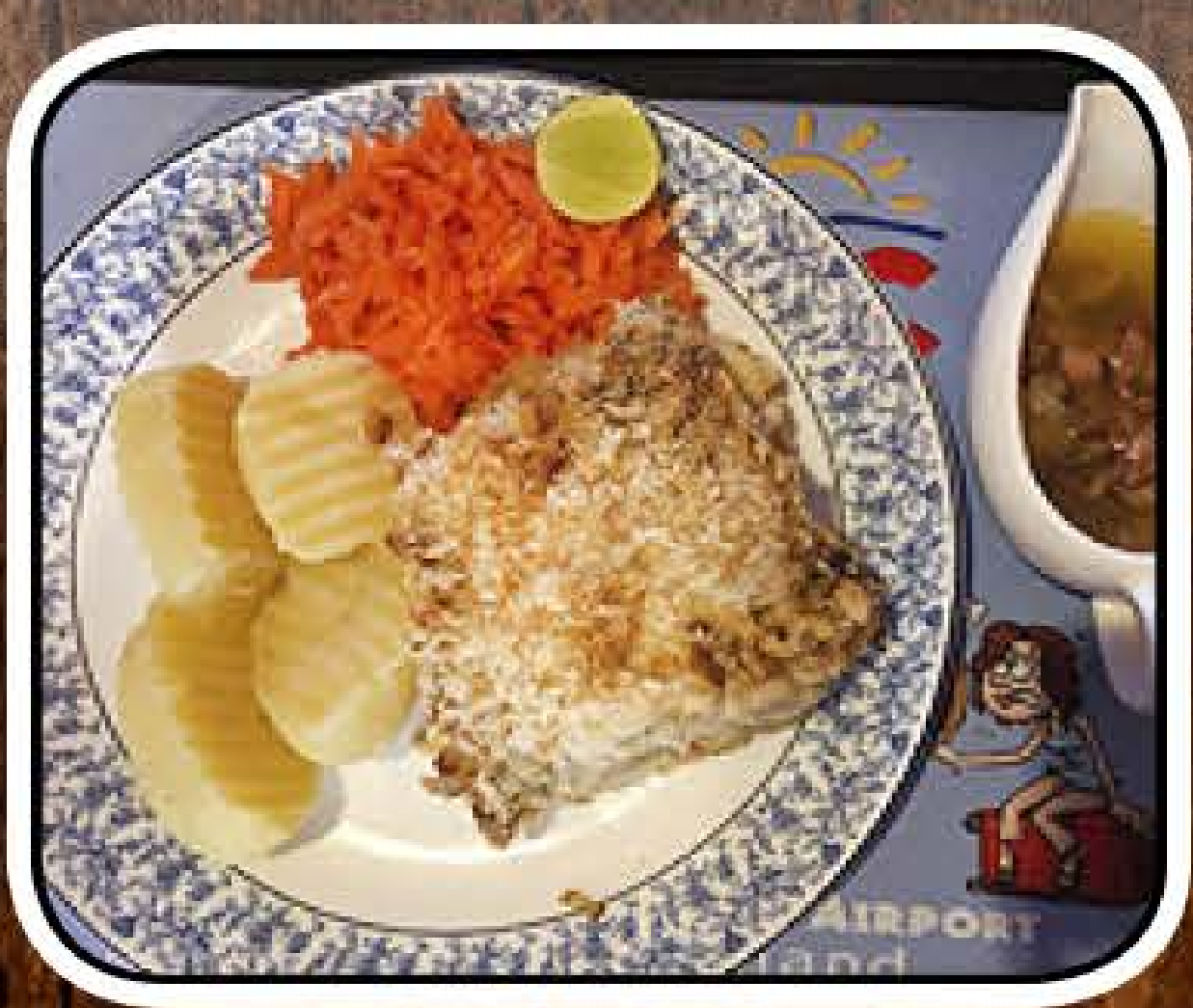
FISKEGRATENG 295 B